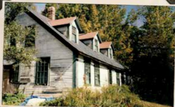
Florence Tarr Home 1994