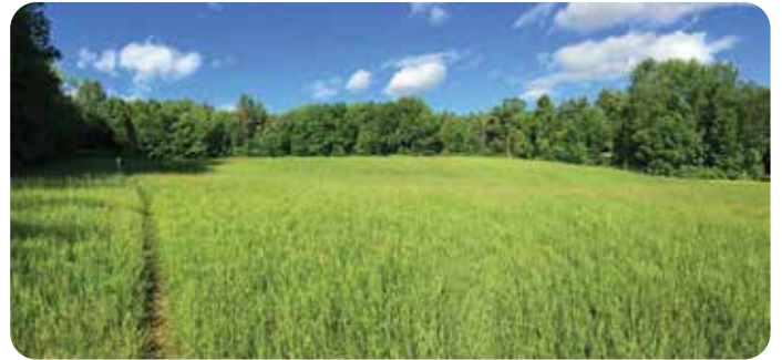
Joppa Hill Farm, Bedford

If you are a past supporter of the Bedford Land Trust receiving the PLC newsletter for the first time, welcome! We hope that after reading this issue you'll be inspired to continue to your support of local conservation as a member of the Piscataquog Land Conservancy.