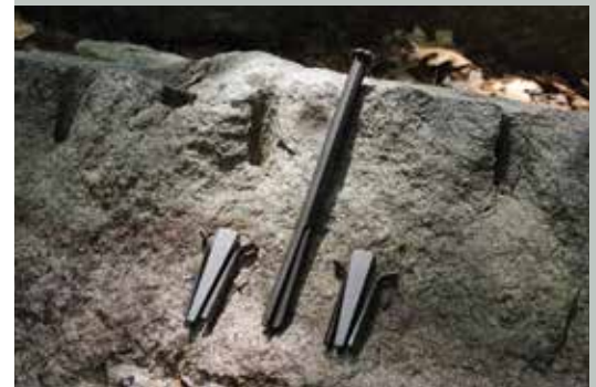
Plug and feathers tools (star drill + sets of plugs & feathers)