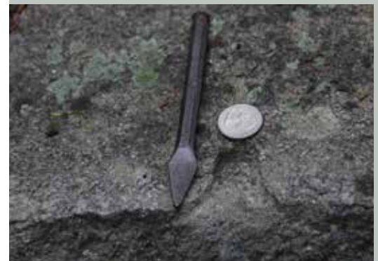
Flat wedge tool (cape chisel)