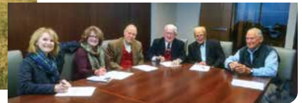
Benedictine Park Bedford

The Bedford Land Trust (BLT), a non-profit organization founded in 1990 to conserve open space in Bedford at a time when the town was undergoing rapid development, has merged into the Piscataquog Land Conservancy. The Bedford group's 704 acres of conservation easements and lands, and its financial assets have been transferred to PLC, under a merger agreement reviewed by the Charitable Trusts Unit of the N H Attorney General's office. The merger became effective January 1st.