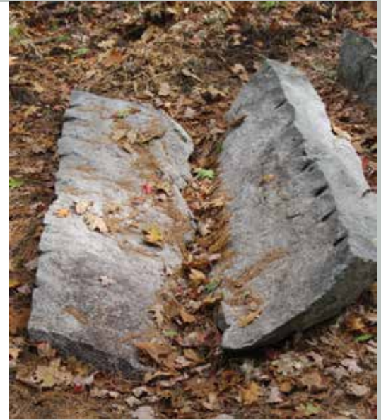
Holbrook Hill split stone